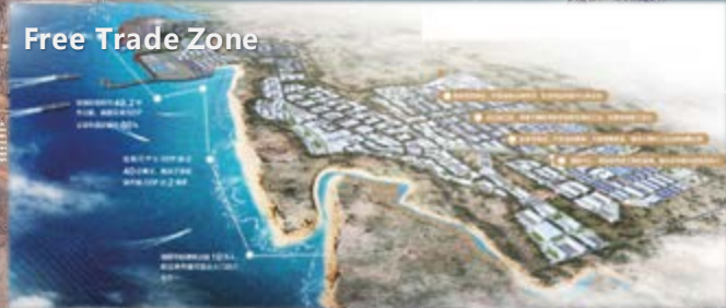
Free Trade Zone

Park Planning: 48 square kilometers First phase: 6 square kilometers Starting area: 2.4 square kilometers 82 companies have become the residents.