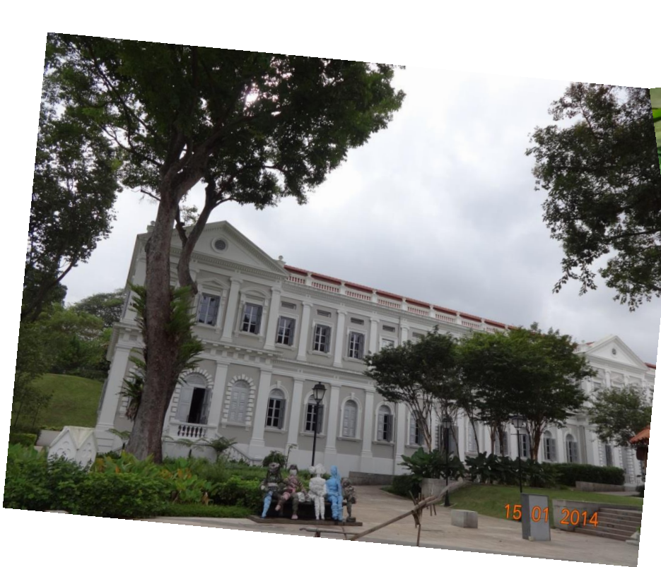
National Museum of Singapore