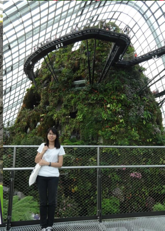
Gardens by the Bay