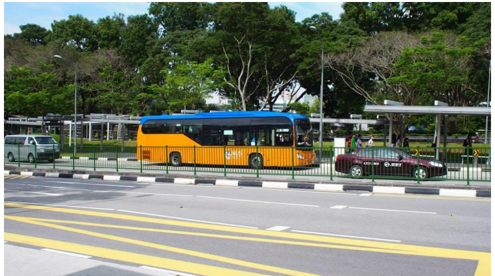
NUS shuttle bus

My buddy brought us to a shopping mall to buy some necessities. It was almost 8 o'clock.