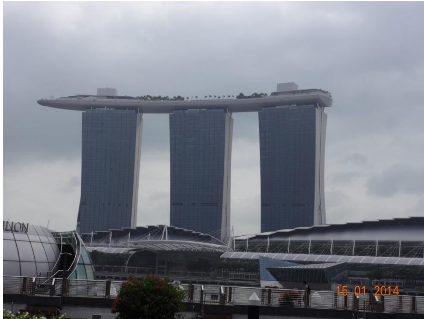
Marina Bay Sands Hotel