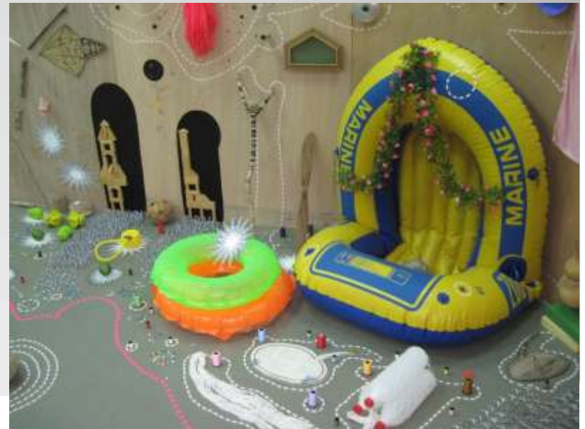
Fang Wei Wen