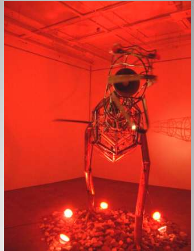
Osage Art Gallery