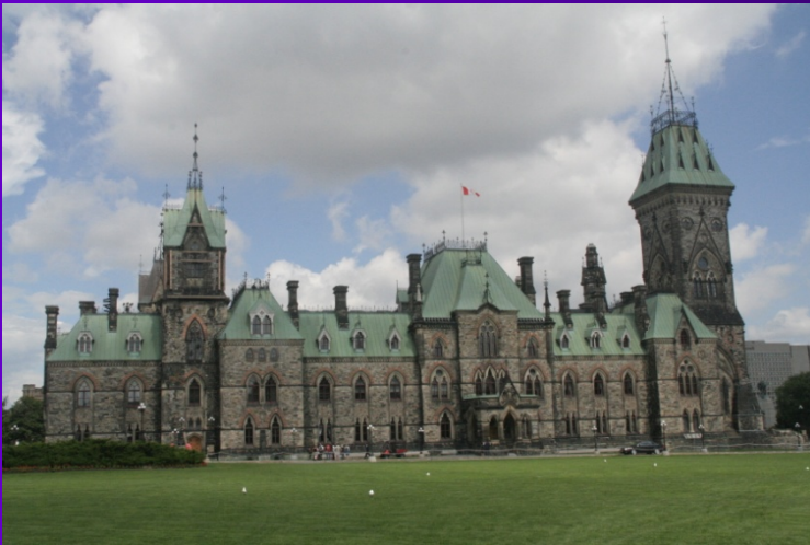
Administrative (Capital) City-Ottawa