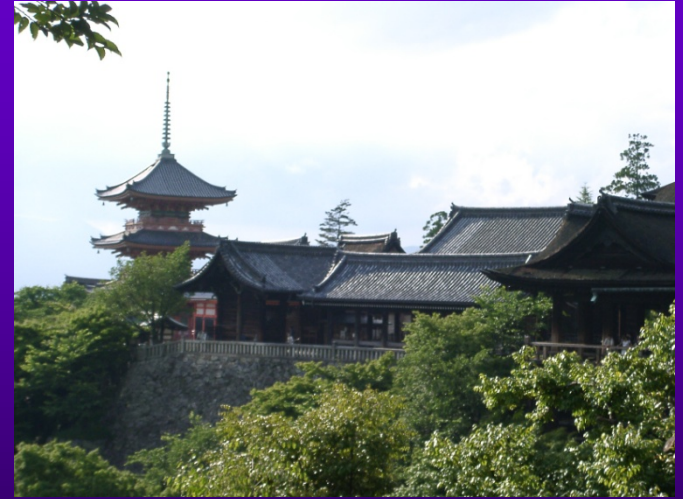
Cultural City, Kyoto, Japan