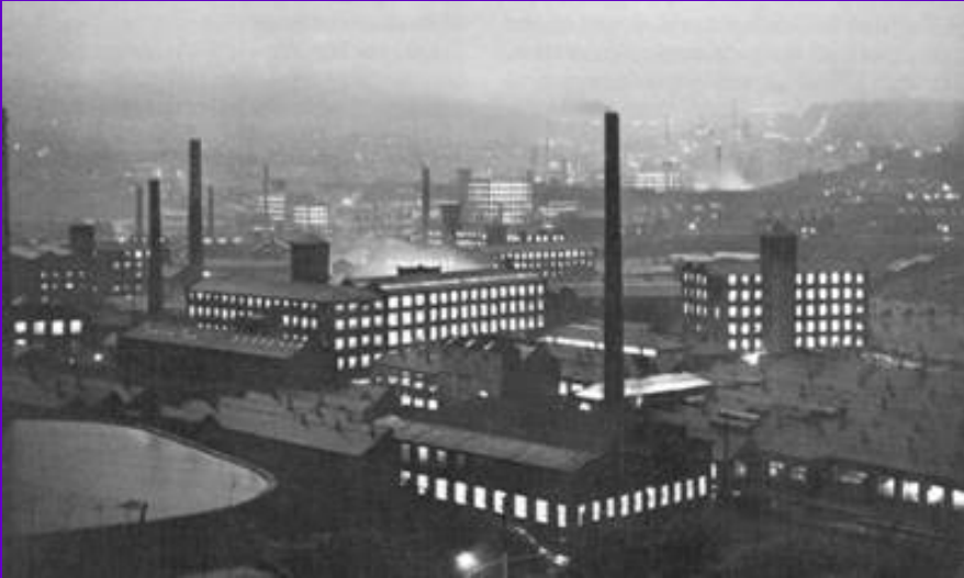
Industrial City, Coketown from Benevolo- History of Modern Architecture, Vol.1