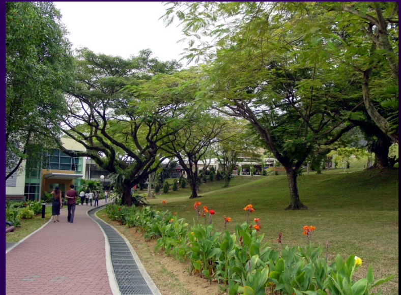
Garden City , NUS, Singapore