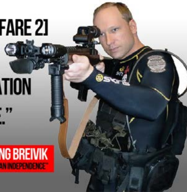
OSLO TERRORIST, ANDERS BEHRING BREIVIK FROM HIS MANIFESTO, "2083, A DECLARATION OF EUROPEAN INDEPENDENCE"

"I SEE [MODERN WARFARE 2] MORE AS A PART OF MY TRAINING-SIMULATION THAN ANYTHING ELSE."