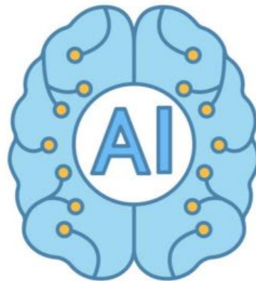
Artificial intelligence (AI)