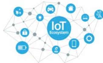
Internet of Things (IoT)