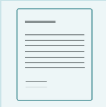
A SHORT COVER LETTER

outlining why you want to attend the workshop and your research interests