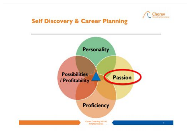
Power Slide about Passion