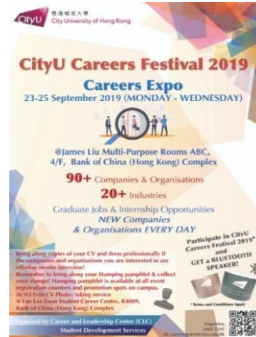
Posters for Career Festival