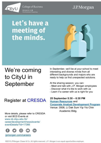
Posters for Recruitment Talk