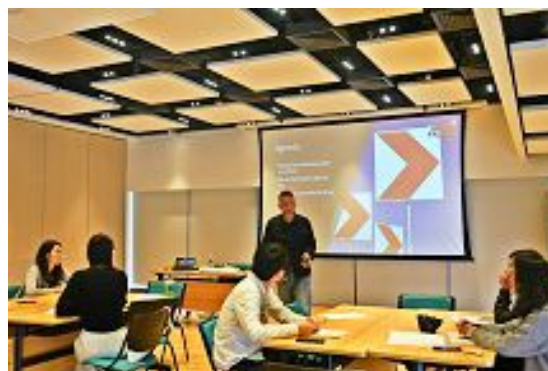
Career Planning Card Game