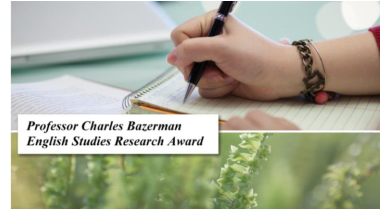
Professor Charles Bazerman English Studies Research Award

https://www.en.cityu.edu.hk/Undergraduates/BA-English/Professor-Charles-Bazerman-English-Studies-Research-Award