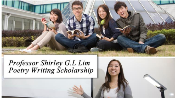
Professor Shirley G.L Lim Poetry Writing Scholarship