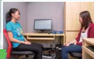
BSL PSYCHOPHYSIOLOGY & NEUROPHYSIOLOGY SYSTEM MP36