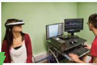
VIRTUAL REALITY SYSTEM